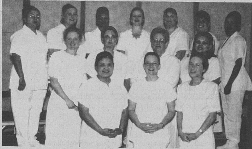
Wharton County Junior College (WCJC) is pleased to announce the recent graduation of 14 students from the Vocational Nursing Program.

Educational programs conducted by the TAES serve people of all ages regardless of socio-economic levels, race, color, sex, religion, disability or national origin.